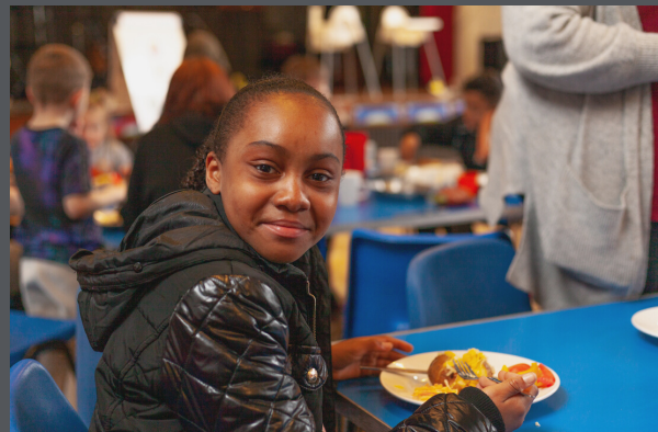
Image Taken at TLG Make Lunch . A Programme that helps feed families that struggle with the holiday hunger gap.