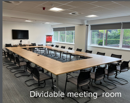
Dividable meeting room